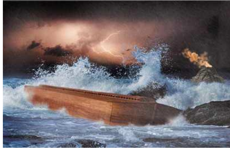
The Ancient World Flooded (But saved 7 people)