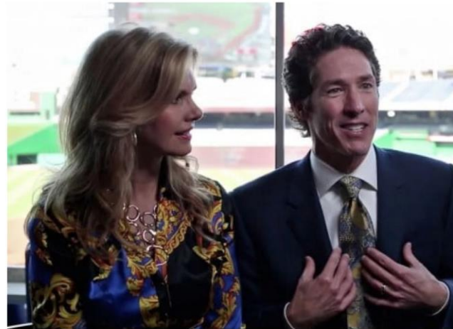
This is Joel Osteen. You helped pay for his house.