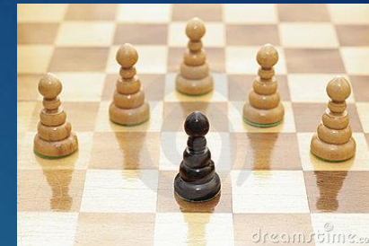
THE CHURCH SURROUNDED

Far from a physical conflict, this battle will be a moral and spiritual one. Satan's Gog and Magog symbolize such forces and agencies as atheism, humanism, communism, materialism, astrology, and all manner of false and perverted religions. Gog and Magog also represent such forces as anarchy (rebellion against all principles and standards of truth); corruption in government and business; immorality with its decay of home, lack of natural affection and devotion to children; sodomy; alcoholism; and total abandonment to a base and sordid life of the flesh. Satan will use the anti-God, immoral standards and practices that he is using today, but probably to a more intense and flagrant degree. Gog and Magog do not gather around a conference table and offer themselves to the devil in a nefarious pact; but being deceived, they are drawn to him as were the kings of old. (HH, Revelation – pg. 397)