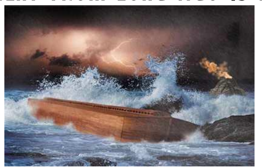
The Ancient World Flooded (But saved 7 people)